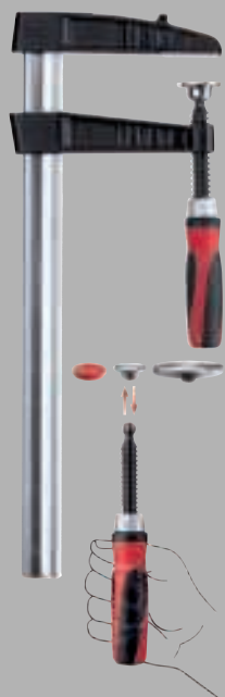
Heavy duty malleable cast iron screw clamp TGK with BESSEY Best-Comfort-System