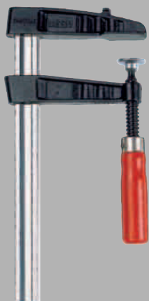
Heavy duty malleable cast iron screw clamp TGK with tried-and-true wooden handle