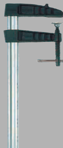
Heavy duty malleable cast iron screw clamp TGK with tommy bar